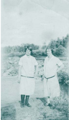
Two visitors to Highlandlake—late 1920s.

In mid-year the Board of Directors of Highlandlake Church, Inc., voted to change the name of our organization. When we were originally founded in 1921, our sole stated mission was to protect and preserve the Highlandlake church building. Since that time, our mission has grown and changed to that of a full-fledged historical society. As a reflection of our expanding mission and goals, we changed our name to Historic Highlandlake Inc. The name change was unanimously approved by the board of directors.